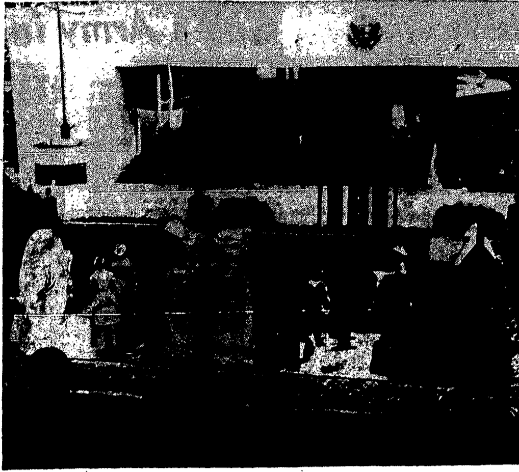
This striking float, entered by the Free State of Maryland in the inaugural parade commemorating the tercentenary of "the first act of religious toleration in the history of the New World." A recording device recited the act of religious tolerance as the float moved along.