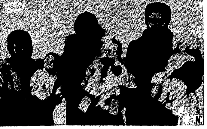
Even Santa Claus doesn't live as close to the North Pole as these Eskimo boys from Hooper Bay, Alaska. The boys are holding presents of dolls sent from children in the United States last July. The boys hold them, because the girls won't see them before Christmas Day.