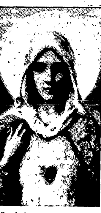
Our Lady are no obstacle whatever to their being called with the fullest right "Catholic Action under the auspices and inspiration of the Blessed Virgin Mary." As they have been in the past, they are and will continue to be a means of safeguarding and protecting the

The Sodality of Our Lady is "Catholic Action under the auspices and inspiration of the Blessed Virgin Mary," according to Pope Pius XII in a new apostolic constitution recently issued to the sodalities of the world. THE RESTATEMENT of Sodality ideals and programs by the Holy Father is timely for Sodality of the Rochester Diocese who this week have gathered 1800 strong at Aquinas Institute in Rochester for a two-day "Congress of Mary" designed to revitalize sodality programs in the schools and parishes of the diocese. Quoting his predecessor, Pope Pius XI, the Holy Father says that Sodalties "are and will continue to be a means of safeguarding and protecting the formation of outstanding Catholics."