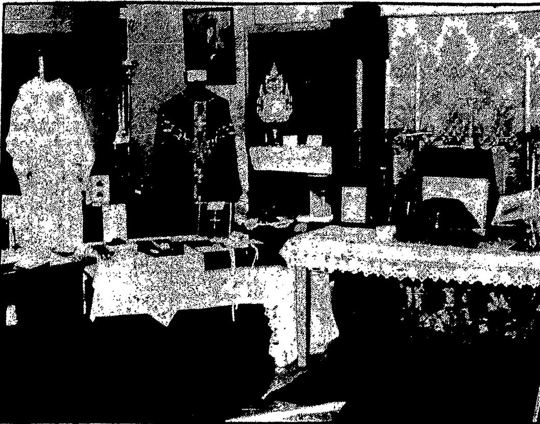
Nazareth College's library in exhibit, portion of which is shown above, had this display of Mass vestments and the altar integrating the library with the liturgy.