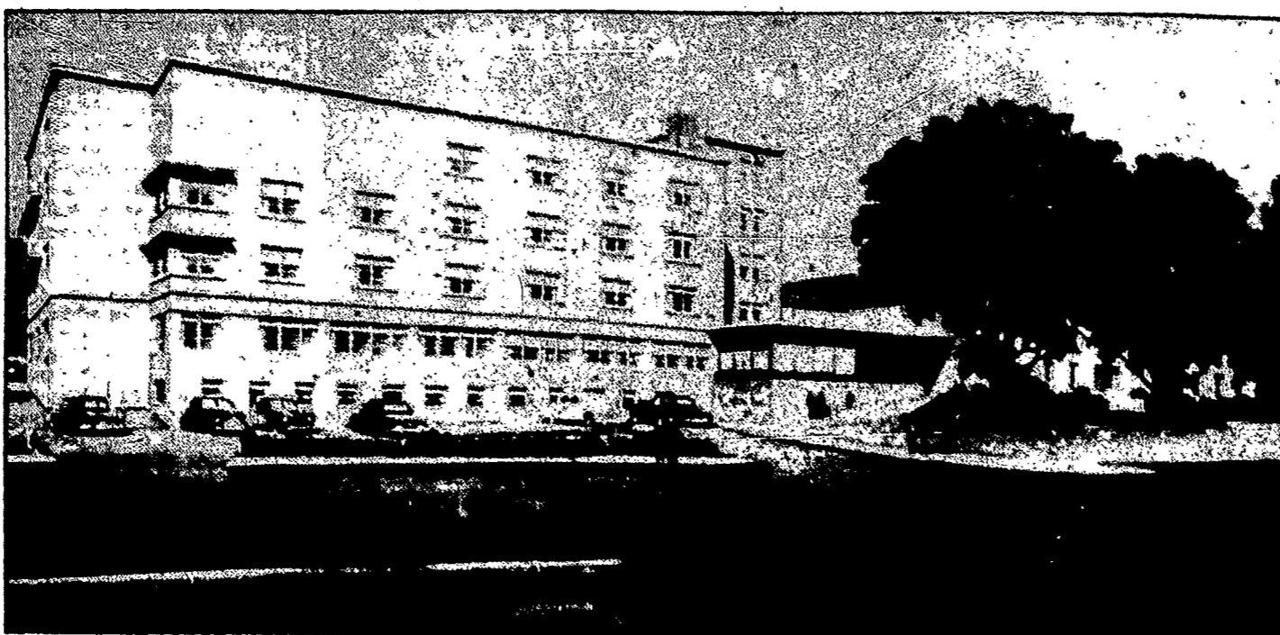
Architect's drawing of the proposed new building for St. James Mercy Hospital, Hornell. Present buildings may be seen in the background at right. Funds for the new building are being

sought in an areawide campaign titled the United Hospitals Building Fund Appeal. (Story on Page 1).