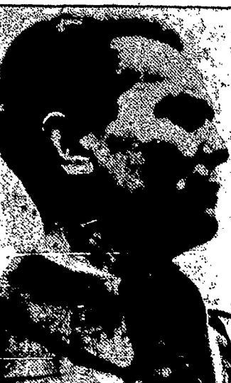
MARSHALL TITO He still persecutes the Catholic Church

The "indictment" of the Bishop, a 3-page document makes the general charge that he was a "collaborator" with Pavle Srdic, head of the wartime independent Croatian State, with Hitler and with Mussolini, that he was responsible for the pastoral issued by the Yugoslav Bishops in October, 1945; that he preached against the "people" and was responsible for "fascist" writings.