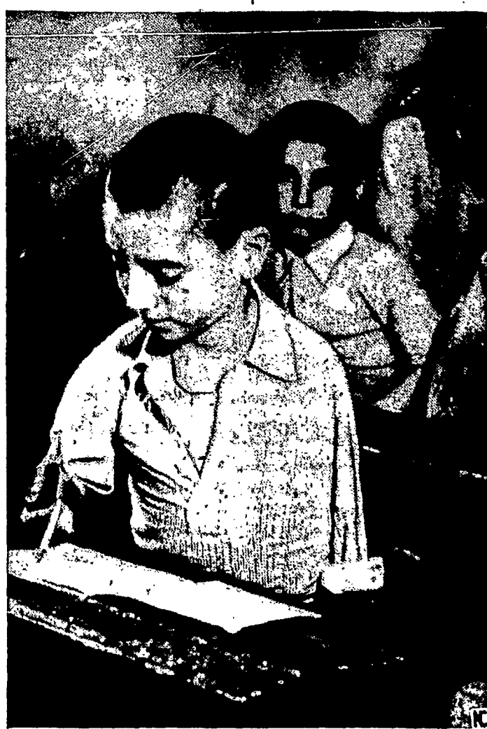
School opens under handicaps for these war-maimed orphans at St. Michael's Orphanage, near Rome. With only stumps for hands, they are taught to use them by artificial means. The institution is one of hundreds supplied with relief materials by the Pontifical Assistance Commission and War Relief Services—National Catholic Welfare Conference.