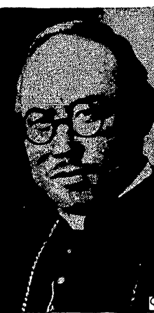
His Eminence Thomas Cardinal Tien, Archbishop of Peiping, has been authorized by the Holy See to pay an extended visit to central and south China for improvement of his health. It is announced at Peiping. Part of his stay is expected to be spent in Taiwan (Formosa). The Cardinal visited Rochester Diocese, in March, 1946.