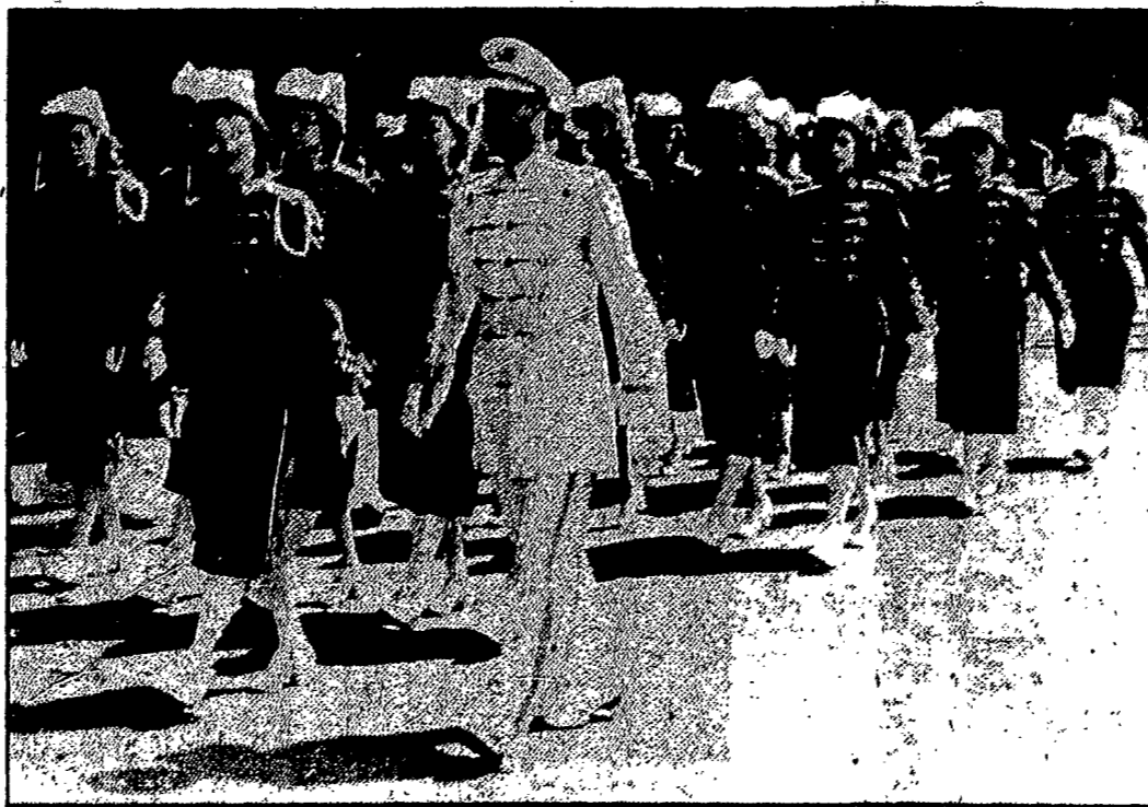
The auxiliary of the International convention of Knights of St. John and Ladies Auxiliaries, next Tuesday in Buffalo, is shown in procession last Sunday at the 30th Memorial Field Mass in Holy Sepulchre Cemetery.

Princeton Gets Maritime (Vatican from 1945 till this month, Naples—(NC)—Jacques Maritain sailed to accept a professorship in French ambassador to the at Princeton University.