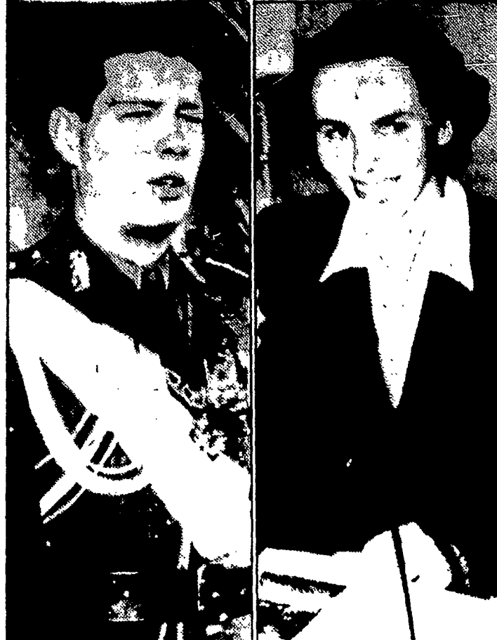
KING MICHAEL PRINCESS ANNE A wedding but no marriage.

THE ROMANIAN people did not want a Catholic marriage, for the Romanian constitution demands that the King and his heirs must be members of the Greek Orthodox Church.