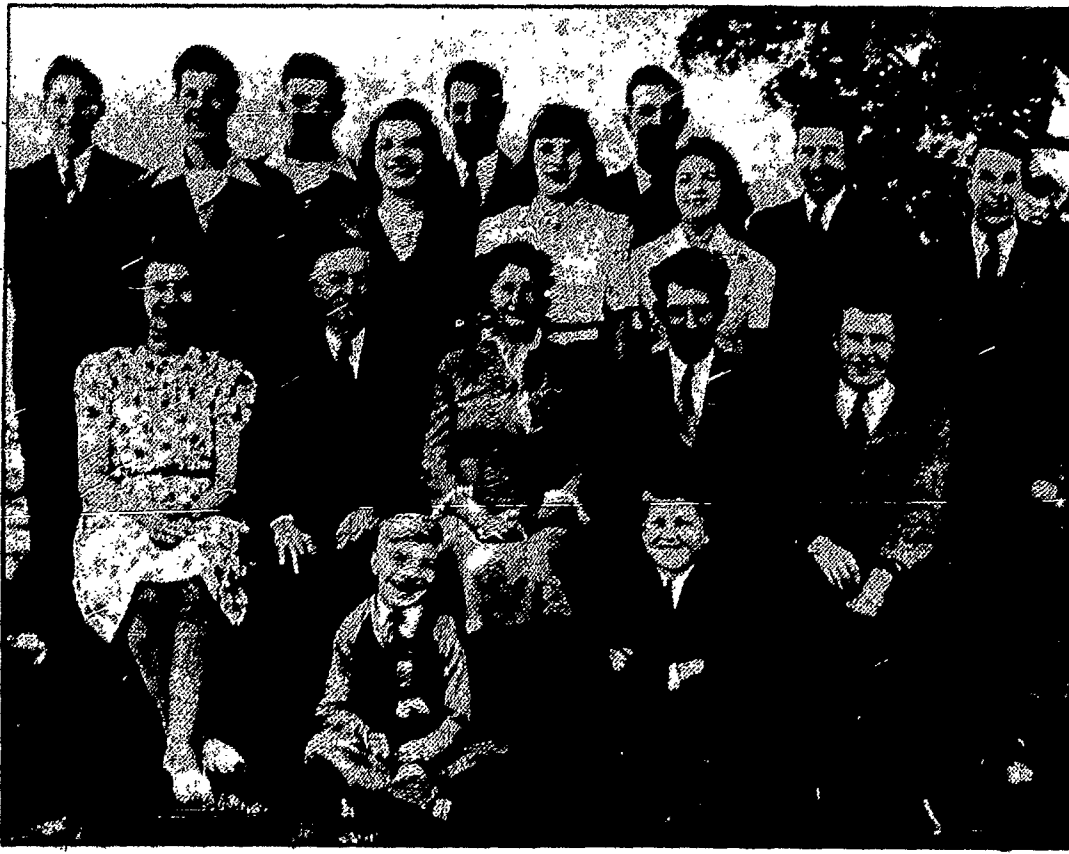
Mother's Day on the Reagan farm in Hathbone will be a memorable occasion for this outstanding Catholic family.

900 Baptized in Burma - Three missionaries who began work among the Chins in the mountainous regions of Burma in 1940 report that 900 have been bap-