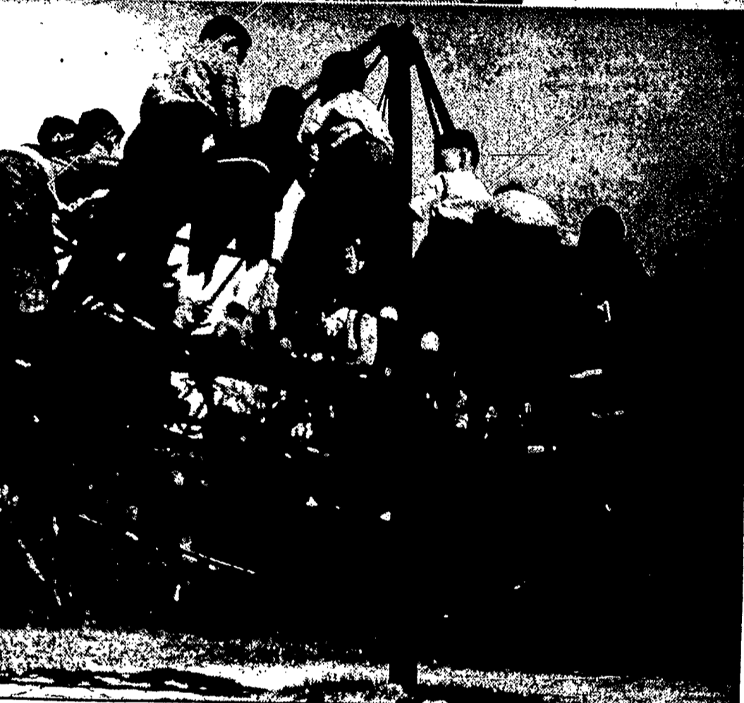
Round and round these happy, healthy youngsters go on their carousel, self-propelled, at St. Joseph's Villa, a Red Feather agency of Rochester Community Chest. Girls of the villa are shown in the top photo with the boys, also at the villa during their recreational time, below. The villa is one of the eight Catholic agencies participating in the Rochester Community Chest.