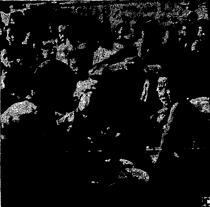
A meal-time scene, as refugees from the Communist areas of China are fed in Peiping by the relief agencies and the nuns. The city is swollen three times its size and the problem of feeding the refugees is a very heavy one.