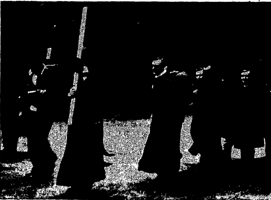
Undertaken in the penitential season of Holy Week, in England, the Student Cross, a pilgrimage of some 30 Catholic college students, was held as an act of reparation in the name of all British students for the acts of all students throughout the world which have been directed against God, against religion and the people who wish to practice religion. In these photos, the parish priest of St. Etheldreda Church, London, blesses the