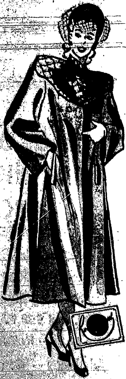
Soft and lovely wool crepe hangs in rich voluptuous folds from a yoke cleverly trim- med with a cross-stitch twist weave. In navy blue and black.