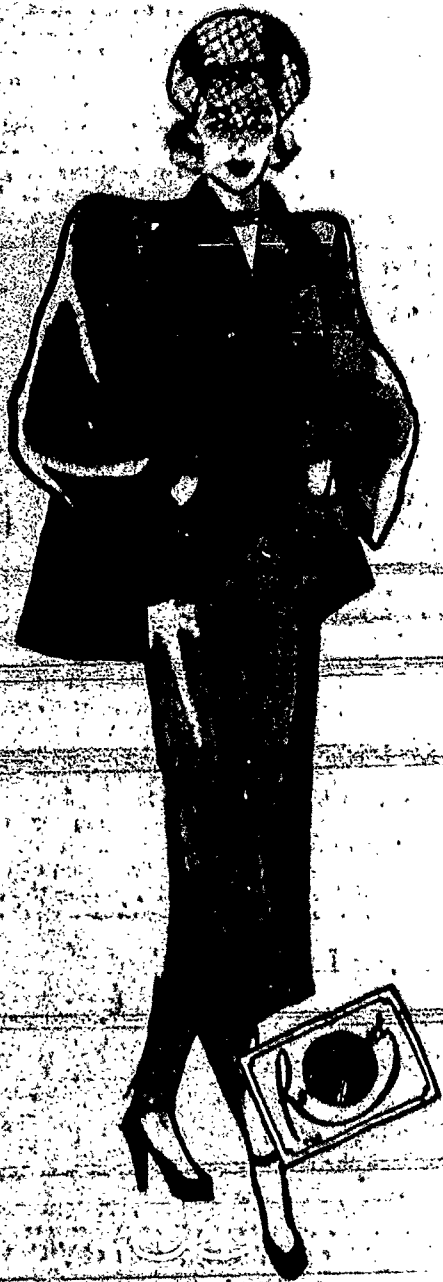
Sheehan's newest version of the fashionable one-wrap, designed to capture some of the charm of the bolero jacket. Garbarded in black or brown with heavy braid trim.

Suits and Coats that present the 'Roundabout' way to fashion!