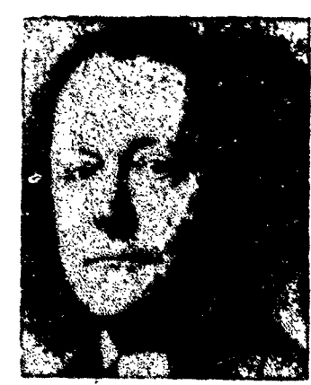
ARTHUR BLISS LANE Diplomat to Poland

SEVENTH SEASON All Events 8:15 P. M. AQUINAS AUDITORIUM Dewey Ave. Series Tickets At Aquinas At Trant's At Tucker's