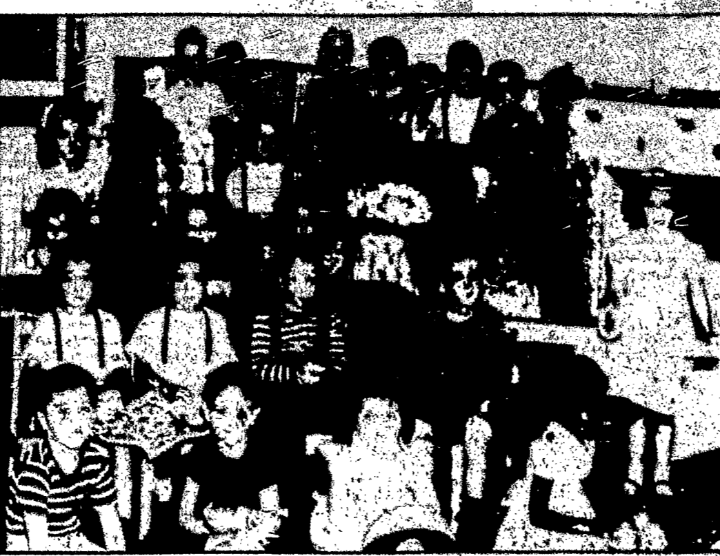
Kindergarten pupils of St. Peter and Paul's School, Elmira, pose for Courier-Journal cameraman. Started a year ago with sixteen pupils, the new kindergarten's registration increased this year to 41 pupils. To accommodate the large enrollment it was necessary to divide the group into morning and afternoon classes.