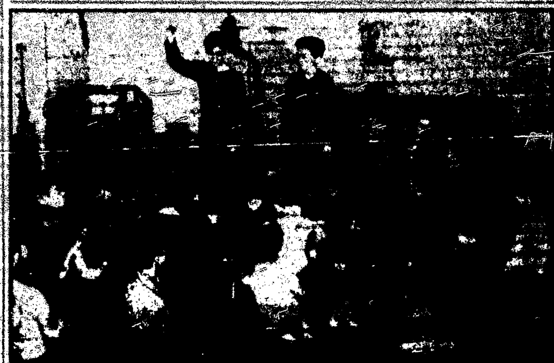
C.Y.O. activity in East Rochester typified above by a youth meeting of which a "runner" is being elected will be included in Columbus Youth Association's 1947 Community Chest campaign, Monday, May 18.