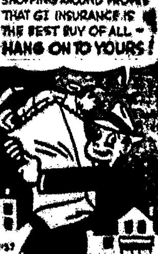
SHOPPING AROUND PROVES THAT GET INSURANCE IS THE BEST BUY OF ALL - HANG ON TO YOURS!

For correct information contact your agent or VETERANS ADMINISTRATION office.