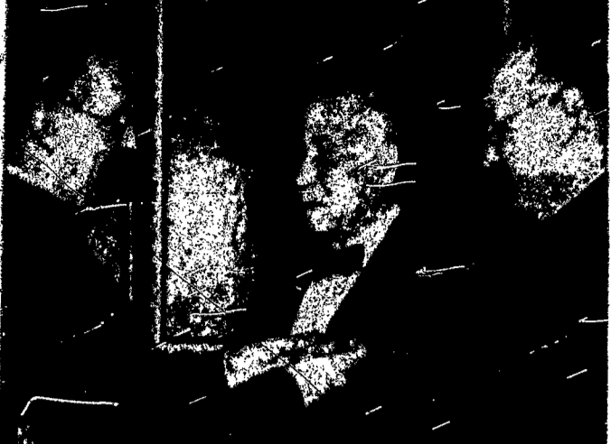
Dr. Carlton J. H. Hayes, historian, author and diplomat, was presented with the 1946 Lestare Medal of Notre Dame University at a ceremony in New York. Archbishop J. Francis A. McIntyre (left), Coadjutor of the New York Archdiocese, also on the medal in the presence of the Rev. J. Hugh O'Donnell, C. S. C., former president of Notre Dame. The award is given annually to an outstanding member of the Catholic laity.