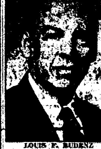
LOUIS F. BUDENZ

BUDENZ TO BARE RED SECRETS IN ROCHESTER TALK Special To Courier Journal New York — A Rochester, N. Y., audience will be one of the first in the nation to hear Louis Francis Budenz brook his year of self-imposed exile and reveal the secret aims of Communism.