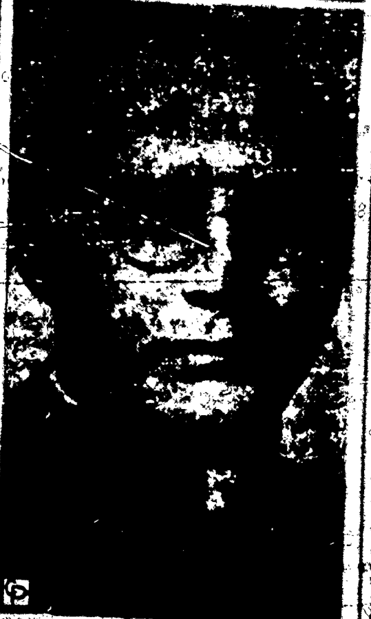
CARDINAL VON PREYSING

The new cardinal said pro-Nazi feeling was spreading even among people who had nothing to do with the Nazis, but are now disillusioned and charge