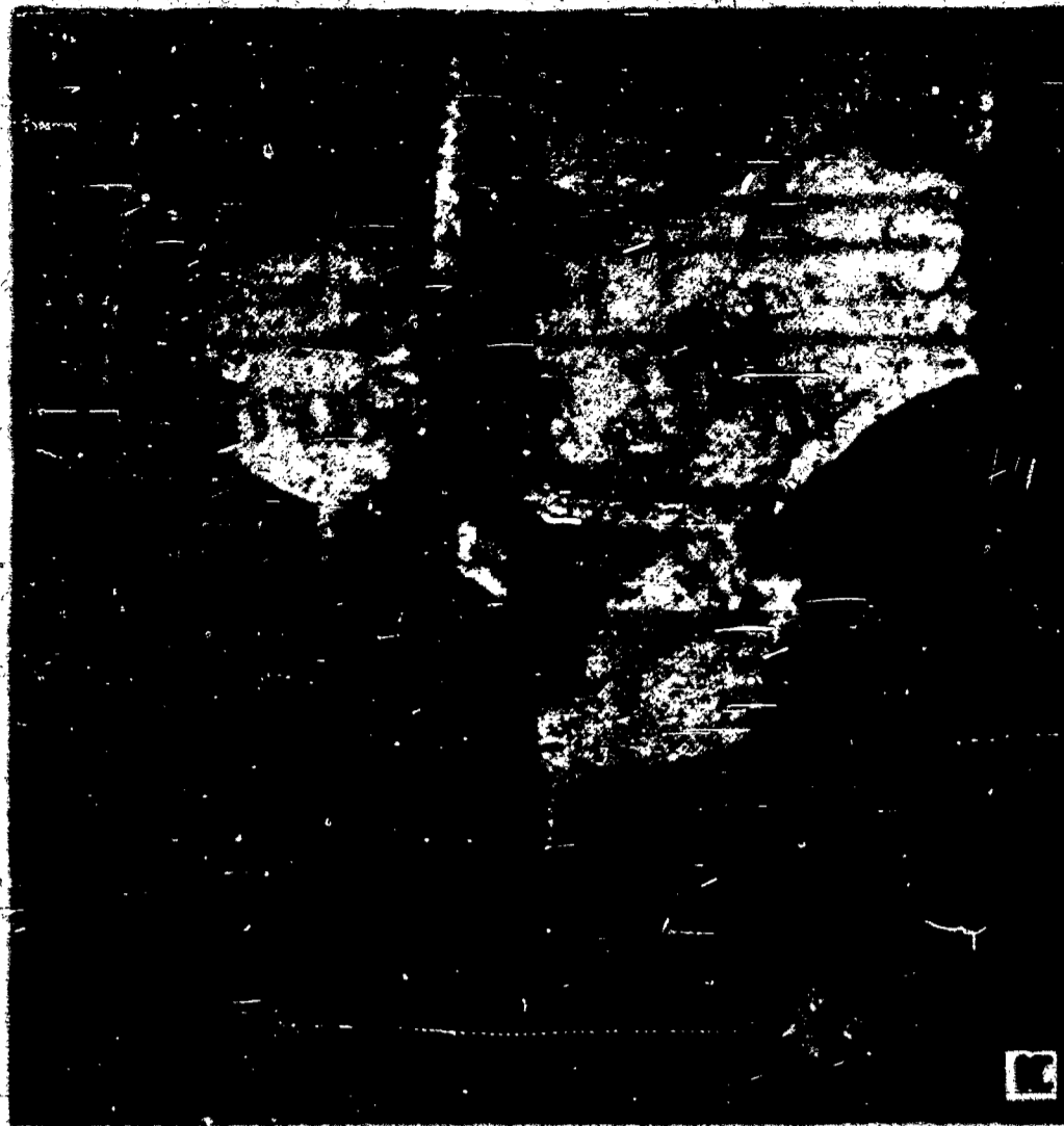
The decoration of the Order of St. Sylvester, oldest pontifical order of knighthood, is pinned on Major General William Donovan of New York, by Cardinal-designate Francis J. Spellman, in the chancery of St. Patrick's Cathedral, New York.