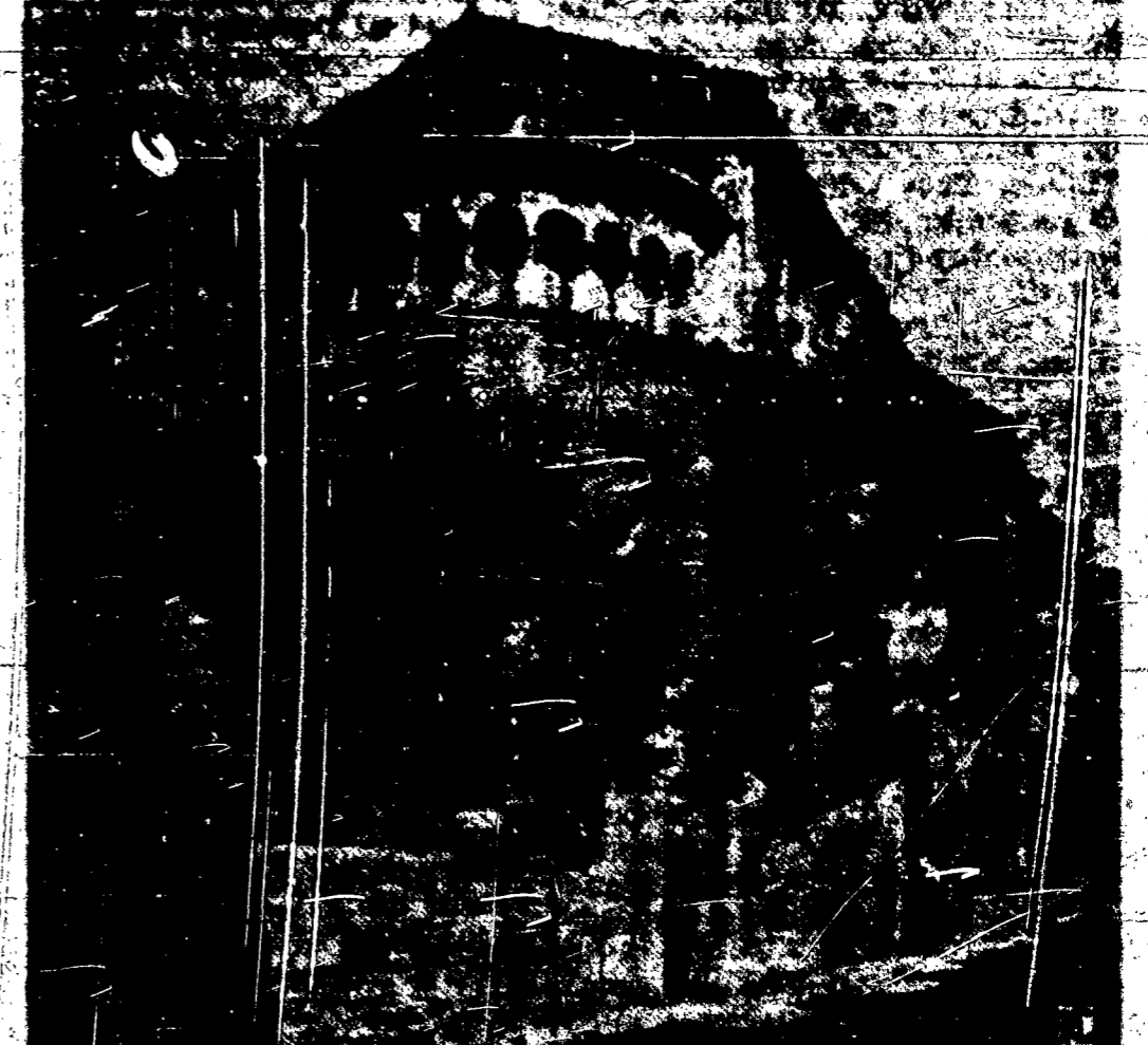
The Church of St. John and Paul, titular church of Cardinal Pacelli with his election as Pope Pius XII, which will be assigned as the titular church of Cardinal-designate Francis J. Spellman, Archbishop of New York. The beautiful old Romanesque building, which contains the bodies of St. John and Paul who were martyred on St. Peter's Hill, south of the Colosseum, Rome.

Send all communications to Catholic Near East Welfare Association 44th St., New York 17, N. Y.