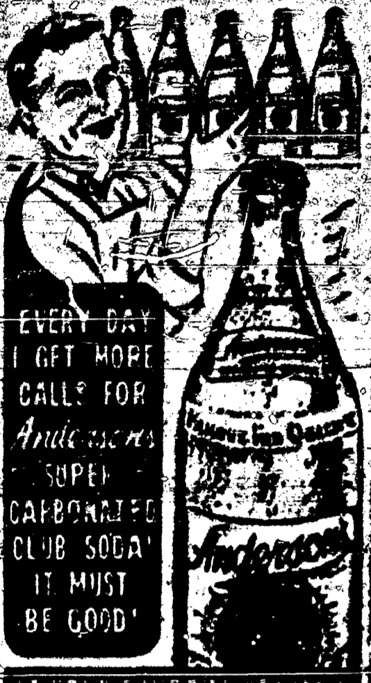
EVERY DAY I GET MORE CALLS FOR Anderson's SUPER CARBONATED CLUB SODA! IT MUST BE GOOD!