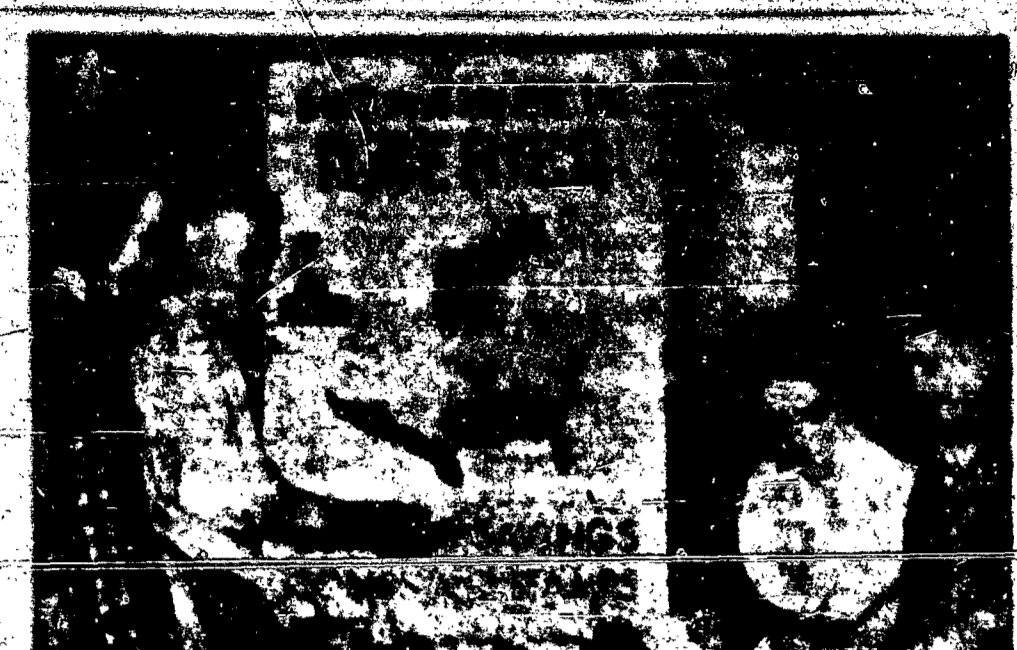
STAMPING OUT ENEMY: Children of diocesan schools purchased almost $2,000,000 in war bonds and stamps to help the war effort. The classroom scene above was repeated in scores of schools during the war years thus far.

Jan. 14, 1943—Catholics took part in a rally of war workers in drive for aid to war prisoners.