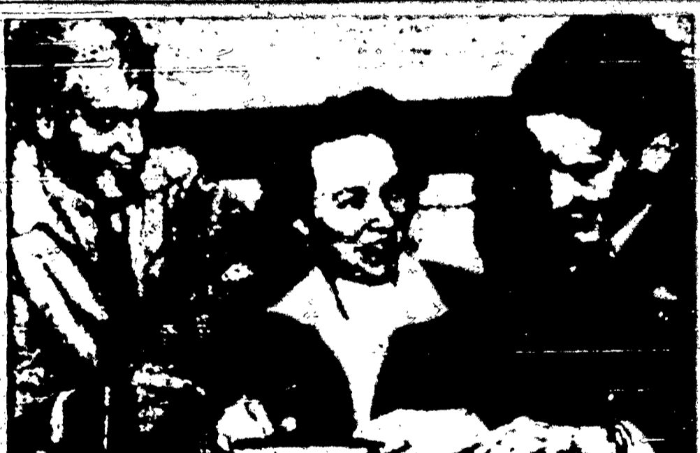
UNDER TWO FLAGS AT USO: Activities in behalf of servicemen and women were widespread throughout the diocese. Shown at

Oct. 7, 1943—A noon Mass was celebrated at the University of the Sacred Heart in Rochester.