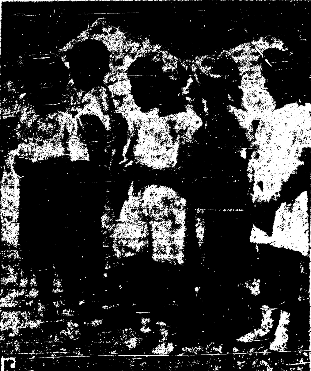
Pictured on their first Communion day are these Jewish children in a refugee camp in the Middle East. They are wearing clothes furnished from a nearby American Red Cross warehouse. Following Communion the children were served breakfast from their ration cards and received hard candies donated by American soldiers stationed in the Middle East. American Red Cross Photo. (NCWC)