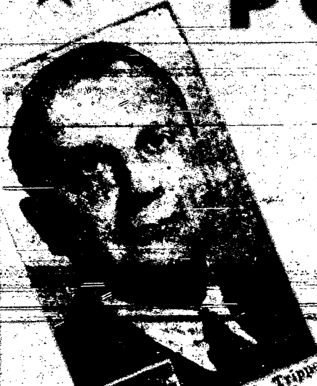
Juan T. Trippe President Pan-American Airlines, Inc.

Some of THE AUTHORS of the Most-Talked-Of Book on the Peace After Victory