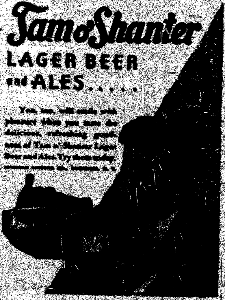
Get Your Supply for the 4th Holidays Now!

FOR EXPERT WEAVING Our Rooms Were EMPIRE TEXTILE WEAVING