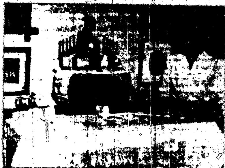
MINIATURE ALTAR belonging to Youth's Guild... Stephen's Communion School...