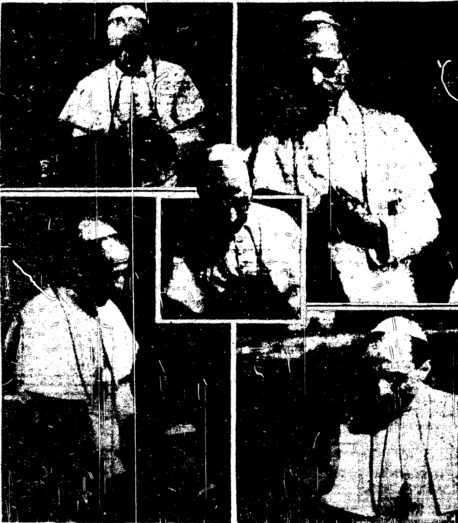
His Holiness Pope Pius XII is depicted in various moods during the public audiences which he holds every Wednesday. The views are from the new motion picture, "Pastor Angelicus," which portrays the life and activities of the Holy Father. The film was given its premiere showing in Rome recently.