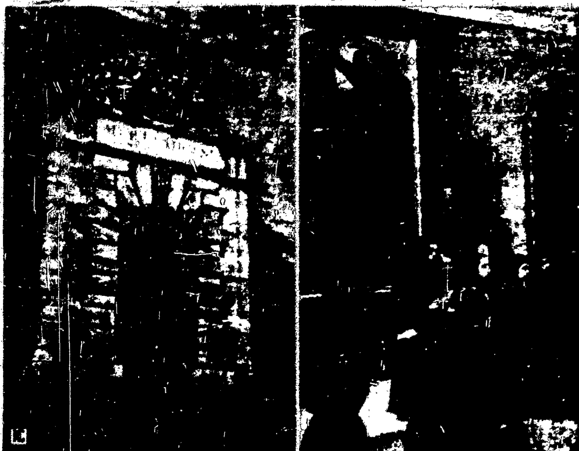
The Vatican Museums report a considerable increase in the number of visitors due perhaps to the closing of parts of the National Museum in Rome and the removal for safe keeping of important treasures there. These views show the entrance to the Vatican Museums and some of the visitors in the Vatican Picture Galleries.