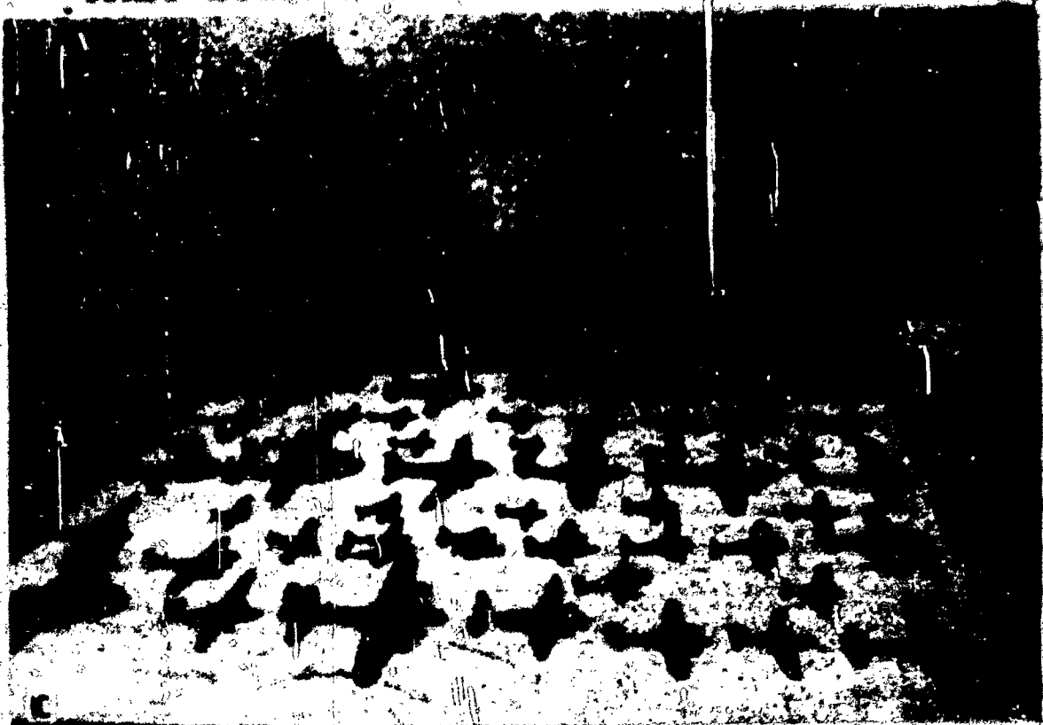
Boys of Holy Ghost Junior High School, Dubuque, have just completed, mostly by hand, a set of fifty model planes for use of the Navy's air-cadet training program. Twenty-five boys took part in the project. Some of them are pictured with the models which are ready to be packed and shipped to the Navy. (N.C.W.C.)