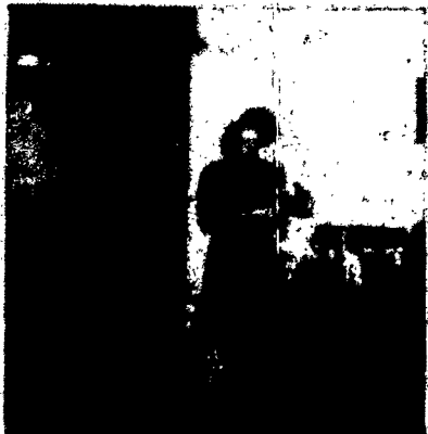
Katharine-K Corset Shop, 603 Temple Bldg. Attention Ladies! Now is the time to wear your Katharine-K to make you one size smaller for your new Spring suits. Call Stone 3238 for a fitting.

ZWIGLES will provide you with those tasty hot and waffles for those cold winter nights which whip-up many a "heart-like" appetite. Serve these waffles with ham at supper time and be assured of a well-earned and liked meal. One that tastes like meat. Ask for Zwigle's at shop at 214 Joseph Ave. Stone 6941.