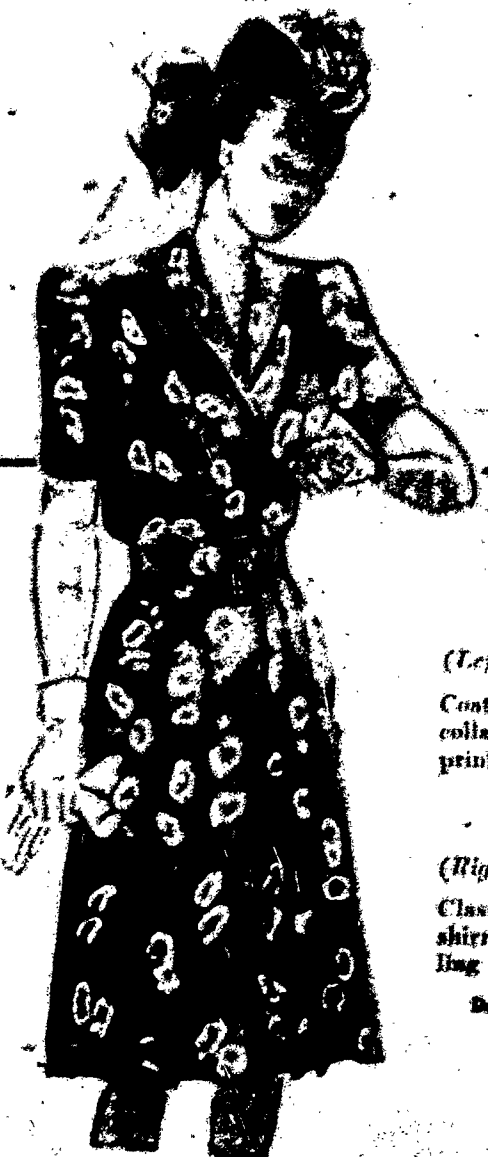
(Left) Cont. dress with shawl collar. Sprawling poppy print. 16½-20½.

You've been asking for our famous $9.00's and here they are! The flattering classics in misses', women's and half sizes. Large spaced prints in your favorite colors with the smart little details you appreciate on much more expensive dresses. Navy, red, green or copper. 12-20, 16½-20½, and 26-34.