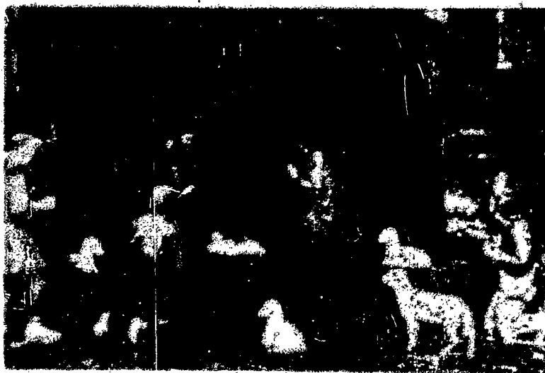
OUTDOOR CRIB ATTRACTS attention of all passing Holy Family Church Rectory at Ames and Lorenza Streets. The life-like presentation of the Nativity scene at Bethlehem was erected under the direction of the Rev. William W. Heisel, pastor.

In addition to these activities boys and girls are busily engaged in holiday salvage projects. Boys are out on a door-to-door canvass for paint brushes 2 inches wide or over while girls are collecting old and nylon hose. The results of these campaigns are being turned in directly to the public centers designated for their collection.