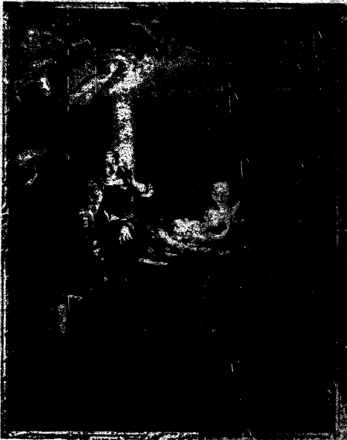
From the painting, Holy Night, by Correggio.