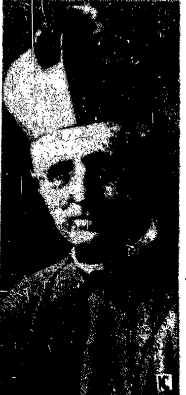
No. 188 — Bishop Emmet

This is one of a series presenting American members of the Hierarchy.