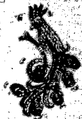
High Collar Pin, of Rhinestones and simulated Pearls. $12.95.