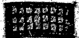
Matching simulated Sapphire Bracelet, set of bracelets. $6.95.