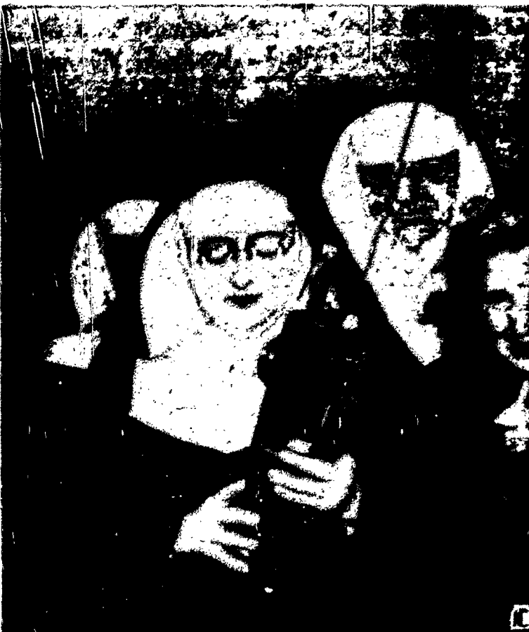
Hundreds of youngsters and their teachers, from St. Elizabeth's and Our Mother of Sorrows schools, Louisville, were among the thousands who viewed the great Army War Show during its nation wide tour. In this picture, some of the Ursuline nuns examine a radio device at the Signal Corps exhibit. Popular also was the Chaplains Corps display featured at the show.