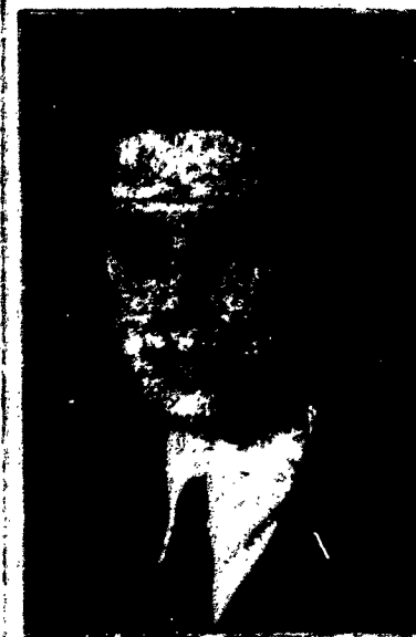
Dr. Mortimer J. Adler

But Europe now is having a new ideology imposed upon it. Living space must be associated with history rather than with geography. The Nazi mind has convinced itself that because of Germany's history it is its right to extend itself spatially. It is another language expressing a totally differ-