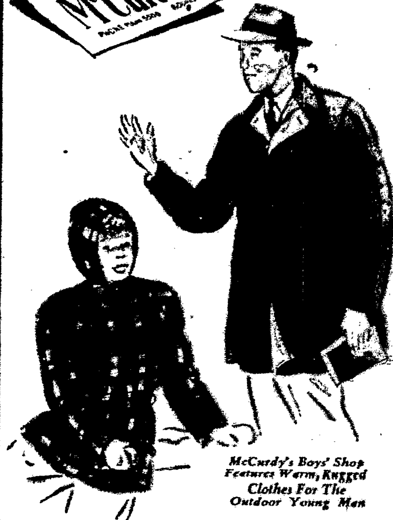
McCurdy's Boys' Shop Features Warm, Rugged Clothes For The Outdoor Young Men