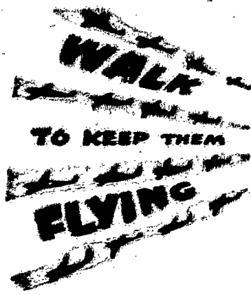
Buy the way—BUY BONDS