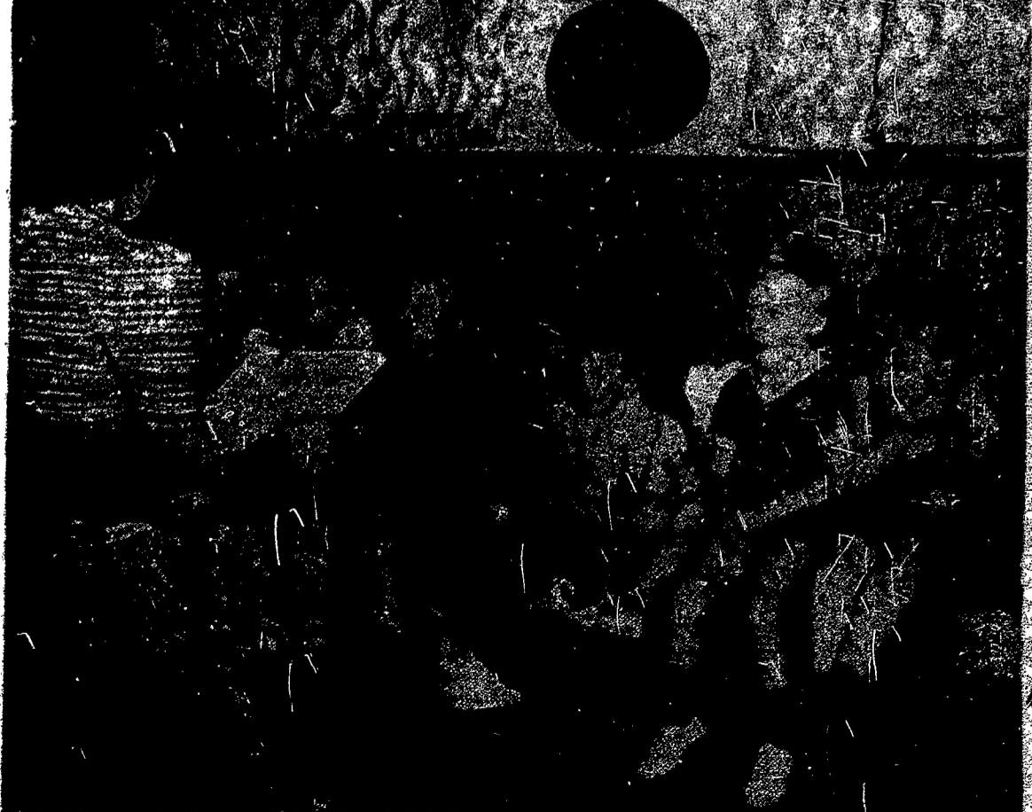
It's story hour for these children of war industry workers, at Center Line, Mich. While their mothers enjoy a few hours of leisure a volunteer entertains the children with their favorite stories, at the local USO Club operated by the Women's Division of the National Catholic Community Service.