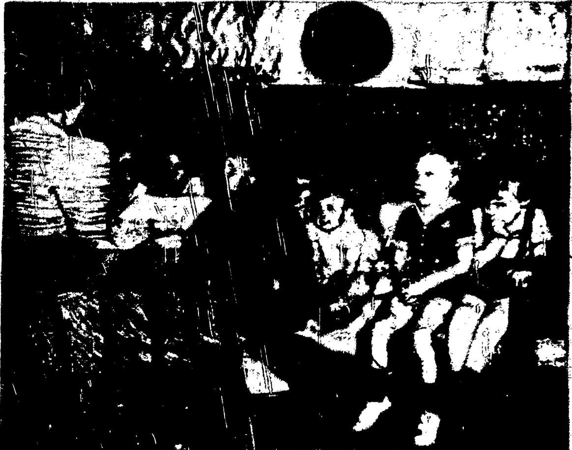
It is story hour for these children of war industry workers, at Center Line, Mich. While their mothers enjoy a few hours of leisure a volunteer entertains the children with their favorite stories, at the local USO Club operated by the Women's Division of the National Catholic Community Service.