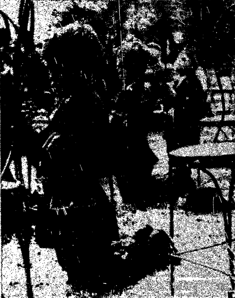
Youthful students at the Linton Hall Military School, Bristol, Va., kneel in prayer during the Military High Mass at the close of the school term. Youngsters, from six to 15 years, live a semi-military life here, answering the call of the bugle. The school is conducted by the Benedictine Sisters.