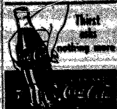
That's what's making more