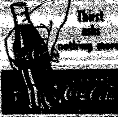
That's what's making more