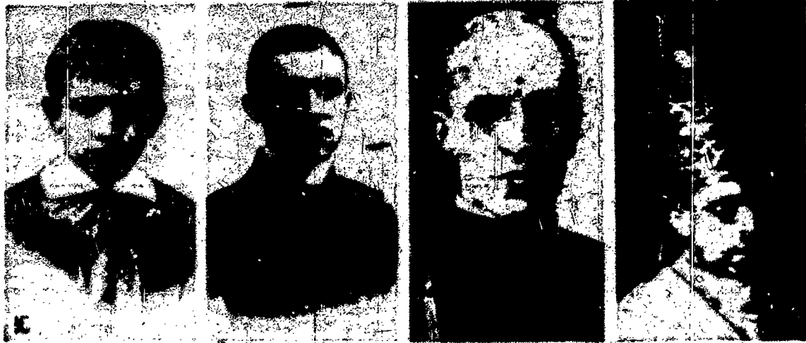
In these pictures Eugenio Pacelli is shown at the age of nine; as a young Manigianer attached to the Sacred Congregation of Extraordinary Ecclesiastical Affairs, at the Vatican, as an Archbishop consecrated May 13, 1917, and as Pope Pius XII, crowned May 12, 1939.