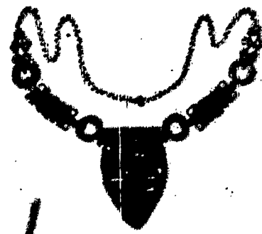
Sparkling Rhinestone Necklace with center of Oval and Baguette Cut-Crystals, $3.95. Others, all metal or set with simulated precious stones, $1.00 to $16.95.