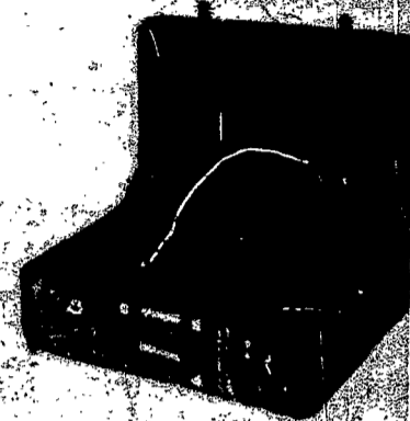
O'Nite Cases Striped Canvas, lined and pocketed. $4.95 Others to $15.00