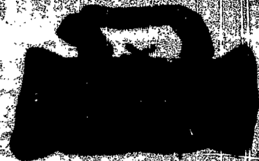
Distinctive diamond set in a Bag of Blue. $12.50